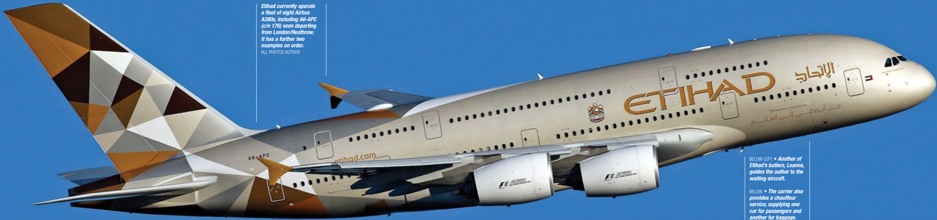
Etihad currently operate a fleet of eight Airbus A380s, including A6-APC (c/n 176) seen departing from London/Heathrow. It has a further two examples on order.