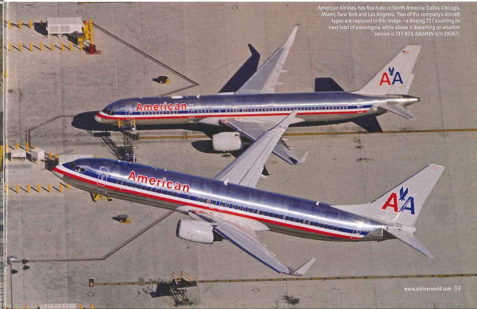
American Airlines, has five hubs in North America: Dallas, Chicago, Miami, New York and Los Angeles. Two of the company's aircraft types are captured in this image – a Boeing 757 awaiting its next load of passengers, while above it departing on another service is 737-823, N804NN (c/n 29567).