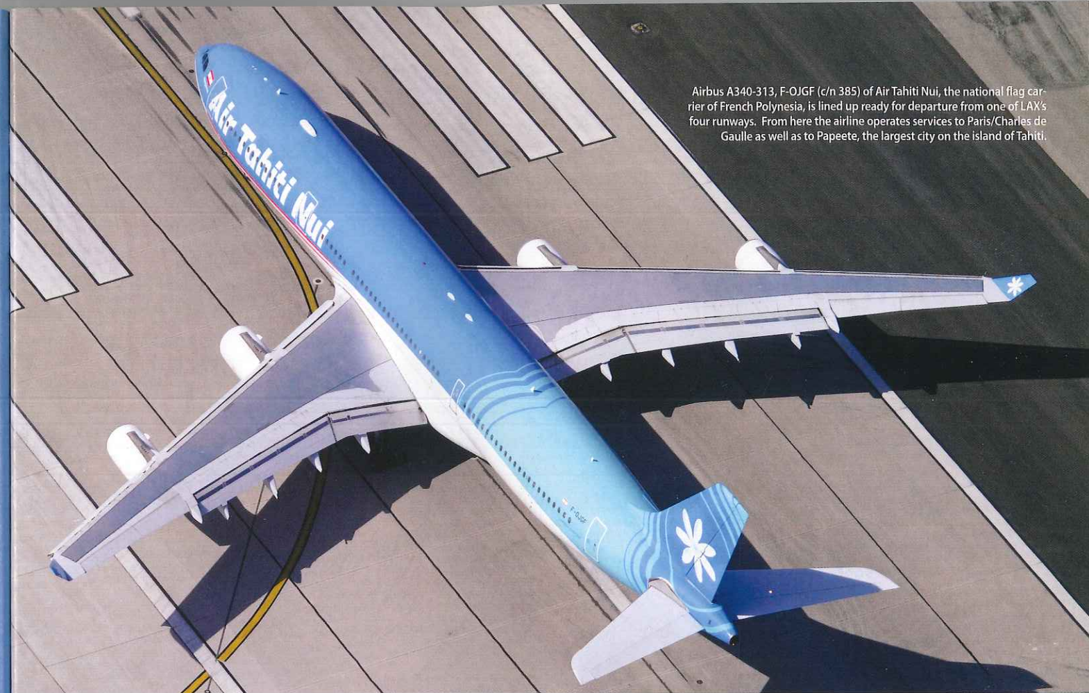
Airbus A340-313, F-OJGF (c/n 385) of Air Tahiti Nui, the national flag carrier of French Polynesia, is lined up ready for departure from one of LAX's four runways. From here the airline operates services to Paris/Charles de Gaulle as well as to Papeete, the largest city on the island of Tahiti.