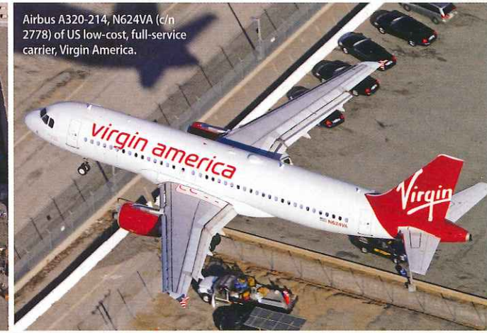
Airbus A320-214, N624VA (c/n 2778) of US low-cost, full-service carrier, Virgin America.