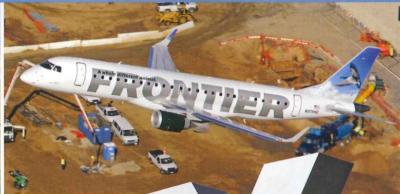
This Embraer E190AR, N175HQ (c/n 0216) is operated on behalf of Frontier Airlines by its parent company, Republic Airlines.