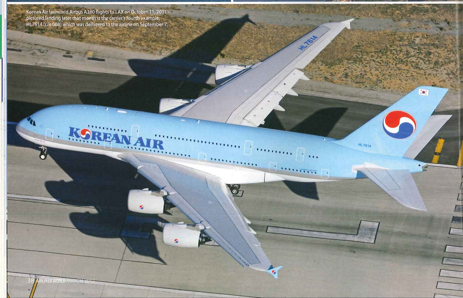
Korean Air launched Airbus A380 flights to LAX on October 11, 2011 – pictured landing later that month is the carrier's fourth example, HL7614 (c/n 068) which was delivered to the airline on September 7.