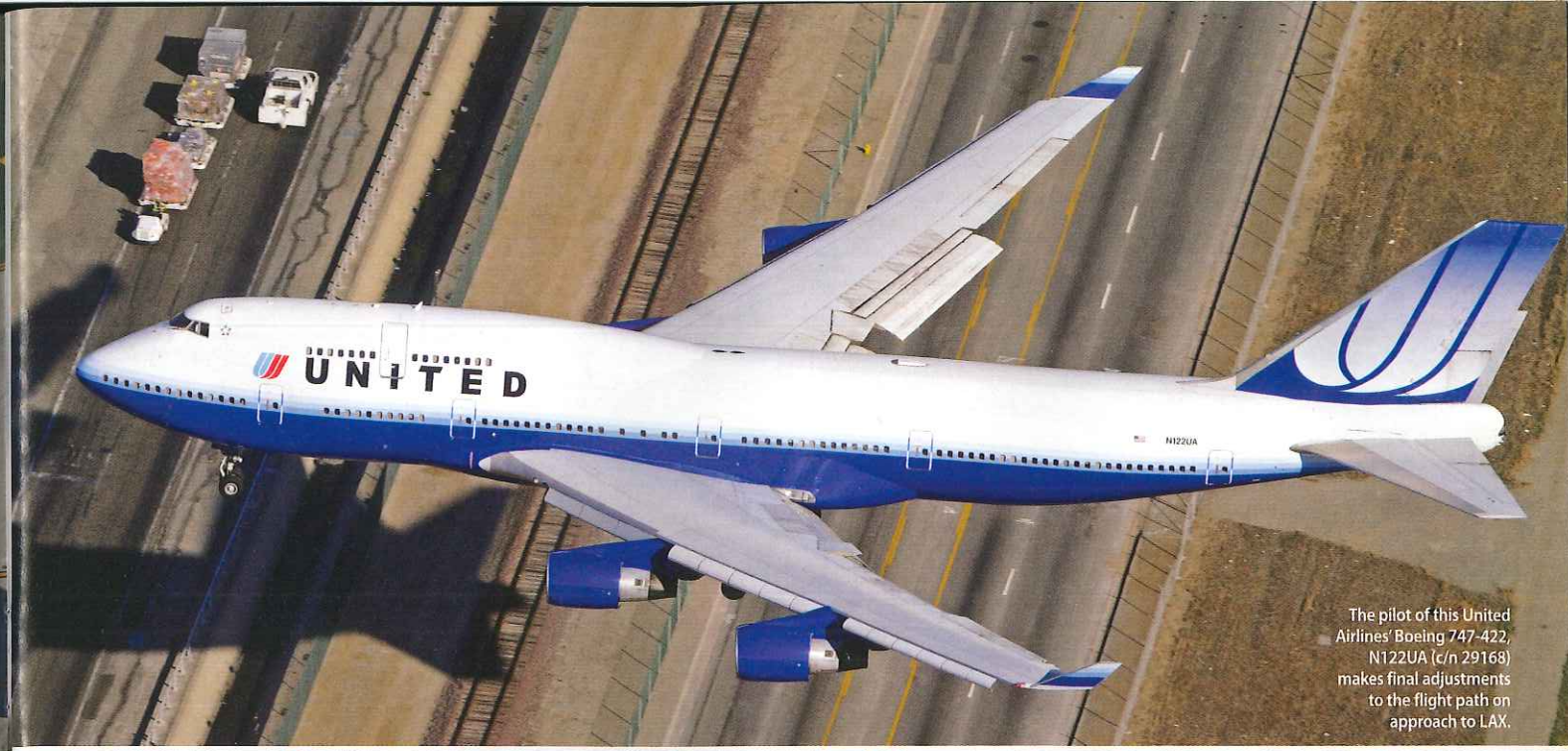
The pilot of this United Airlines' Boeing 747-422, N122UA (c/n 29168) makes final adjustments to the flight path on approach to LAX.