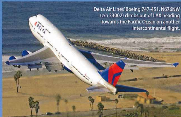
Delta Air Lines' Boeing 747-451, N676NW (c/n 33002) climbs out of LAX heading towards the Pacific Ocean on another intercontinental flight.

One of the world's foremost freelance aviation photographers, Hong Kong-based Sam Chui , has submitted a selection of the pictures he has taken during sorties over Los Angeles International Airport (LAX).