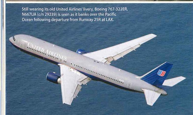
Still wearing its old United Airlines' livery, Boeing 767-322ER, N667UA (c/n 29239) is seen as it banks over the Pacific Ocean following departure from Runway 25R at LAX.