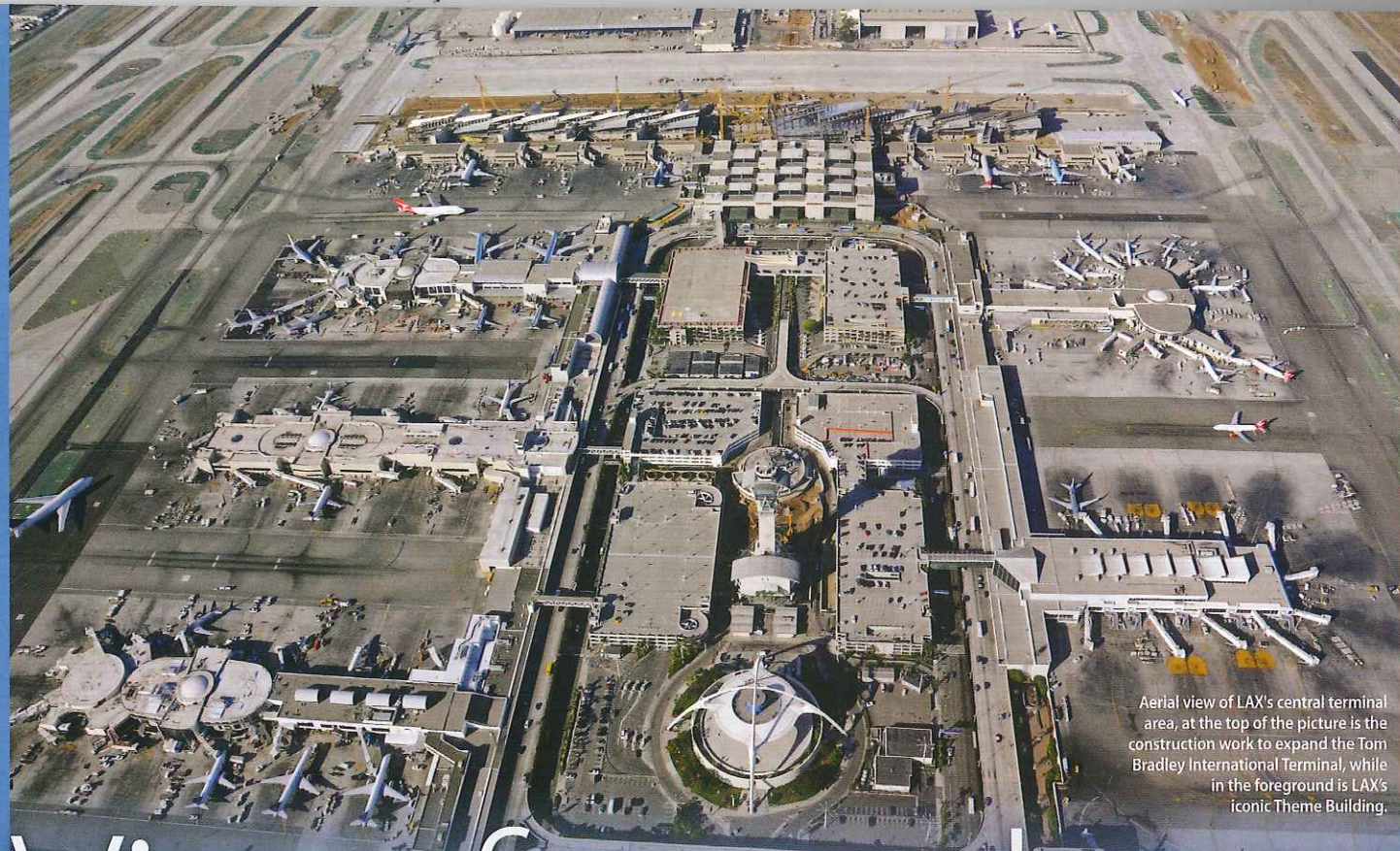
Aerial view of LAX's central terminal area, at the top of the picture is the construction work to expand the Tom Bradley International Terminal, while in the foreground is LAX's iconic Theme Building.