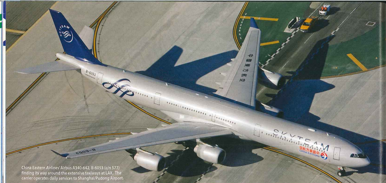
China Eastern Airlines' Airbus A340-642, B-6053 (c/n 577) finding its way around the extensive taxiways at LAX. The carrier operates daily services to Shanghai/Pudong Airport.