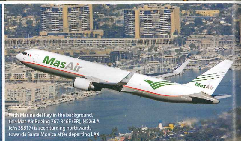
With Marina del Rey in the background, this Mas Air Boeing 767-346F (ER), N526LA (c/n 35817) is seen turning northwards towards Santa Monica after departing LAX.