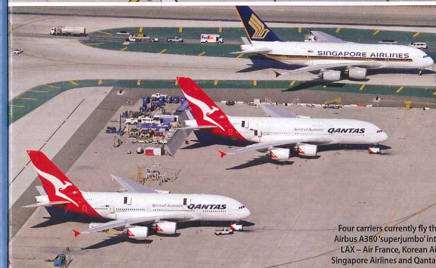
Four carriers currently fly the Airbus A380 'superjumbo' into LAX - Air France, Korean Air, Singapore Airlines and Qantas.